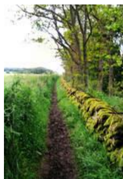
Pathway outside Pitlochry, Scotland.

Creation Care is sponsoring an art exhibit during the month of September that celebrates Creation. Seventeen congregants, former congregants and relatives of congregants have submitted artwork for display in the FCC sanctuary. Represented in a wide variety of media, the artwork is centered on the theme of "Appreciating Creation." Each artist has written a personal reflection about his or her art that will accompany the selection.