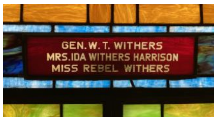
The Withers & Harrison family dedication panel in the FCC sanctuary.