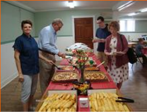
"Mille grazie" to the deacons for an outstanding ITALIAN meal in September!