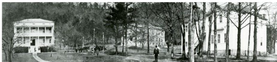
Morehead Normal School early buildings: left to right Withers Hall, Burgess Hall, Hargis Hall

Entering the campus of Morehead State University today, one catches a glimpse of towering obelisk announcing the year 1887 as the date when the school was founded. This inscription emphasizes the significant school in laying the groundwork of the present