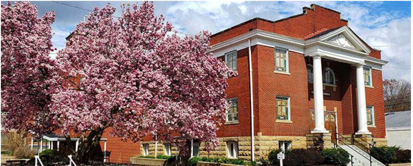
Morehead First Christian Church