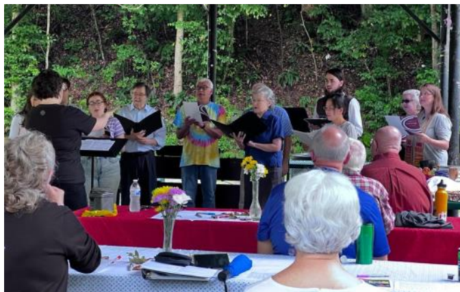
FCC Choir, September 2022