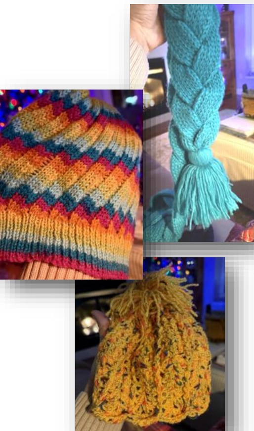
Coffee Tree Books/A Good Yarn knitters donated handmade scarves and beanies.