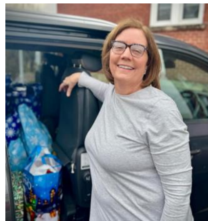
Outreach Committee members help load cars and deliver gifts on December 10, 2023.