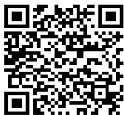
iOS Mobile App QR Code