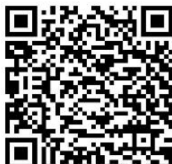
Android Mobile App QR Code

Our Church Directory is powered by Instant Church Directory .