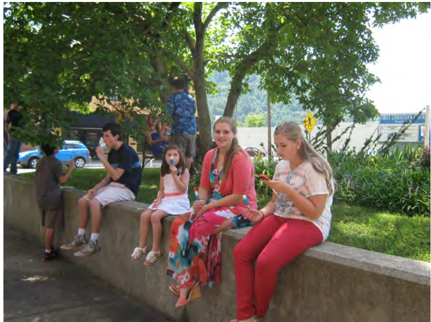
Some of the youth enjoying dessert after lunch.....