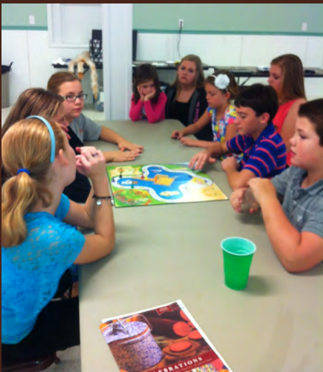
Photo of the Youth Group during their September 29 meeting.

Thanks to the MSU golf team for helping to set up tables and chairs for our First Sunday Lunches!