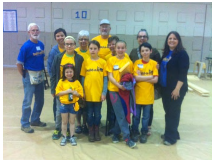
The Youth visiting Build-A-Bed.