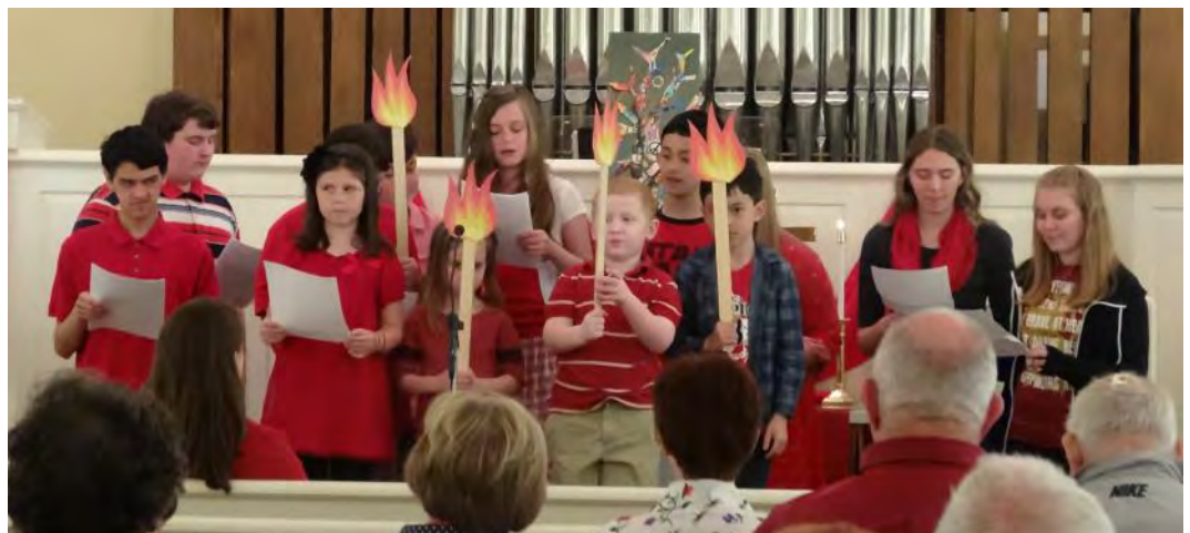
Youth Sunday, May 15, 2016