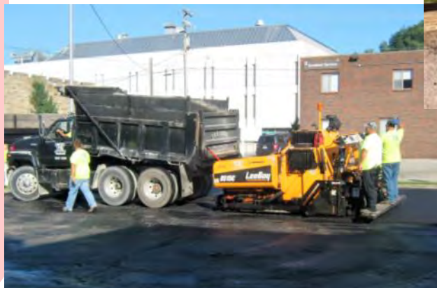
Parking Lot Repaving June 28-29, 2016