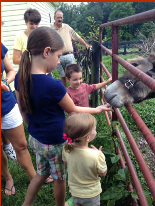
Loving on Donkey Xote at the new member party at Leonderosa.

Looking to give someone a birthday of anniversary gift? Why not send a kid to camp in honor of that person or persons? Cards to send to the recipient are available in the church office and the donations are $25 each.