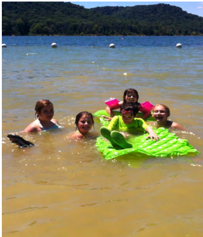
FCC Youth having fun at the beach!