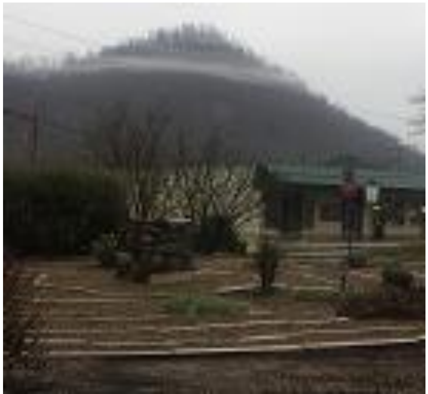
An Early Morning Mist