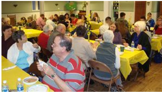
First Sunday Lunch March 5, 2017