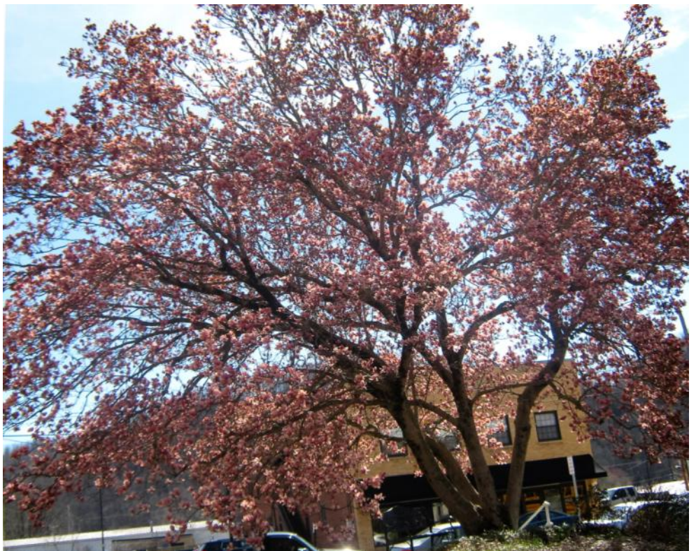
The View Outside Our Window